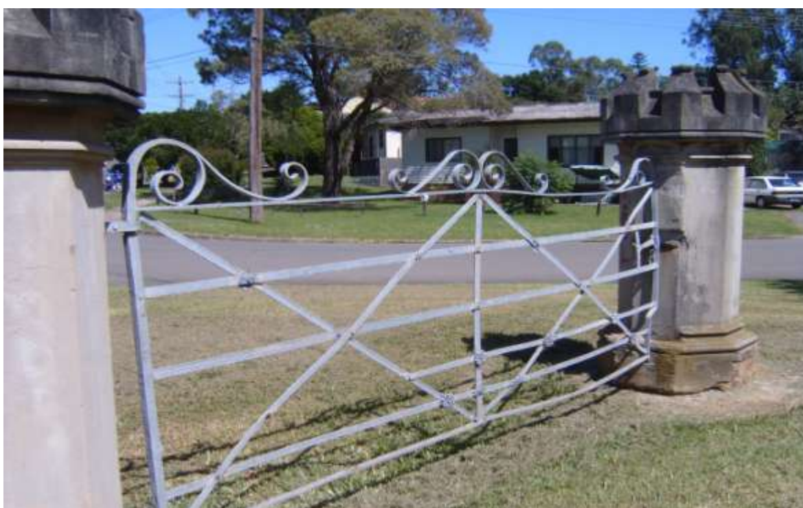
The two surviving Turret gate posts in Flushcombe Turrets Reserve, Lancelot Street, Blacktown. The provenance of the gate itself is not known, but it does appear in the photograph of the turrets at Christ Church, above. Images by Les Tod, January 2008.