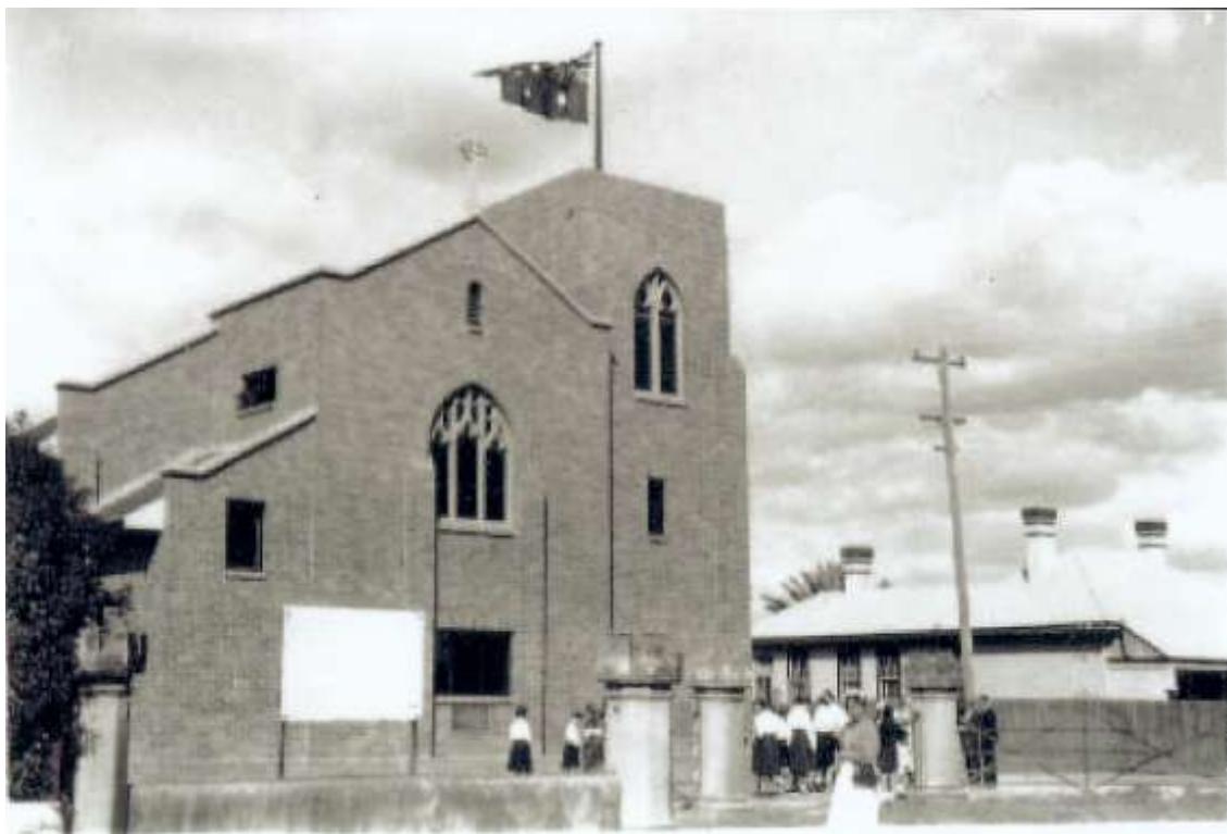
Christ Church, Blacktown, in the 1950s, showing the four turreted gate posts from Flushcombe Turrets . This is the second Christ Church building, the first having been demolished.

In November 1910 the land was advertised again, this time as a dairy farm, known as Flushcombe Estate , and subdivided into “twelve paddocks”. 60 Yet again, in July 1913, it was reported that “ Flushcombe Turrets, a property of 310 acres, with three cottages, has recently been sold. It is now used as a dairy farm by Mr Garrard but we understand it will shortly be subdivided and sold in small areas for mixed farming. ” 61 The mansion had gone, but the name remained and is perpetuated today in Flushcombe Road.