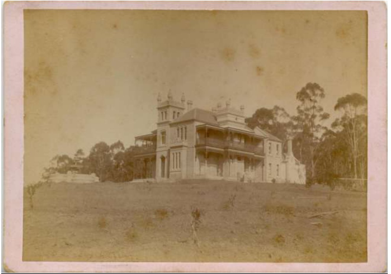
The only known photograph of Flushcombe Turrets, circa 1905.