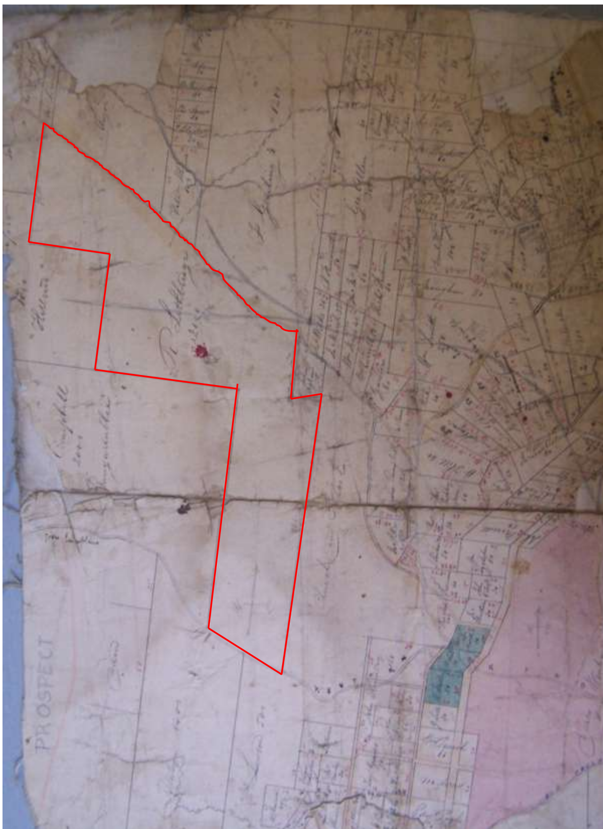
Plan believed to be dated 1832, showing the Lethbridge grant [outlined in red]. The railway is not shown, although somebody has later pencilled it in.